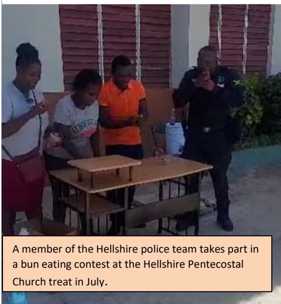
A member of the Hellshire police team takes part in a bun eating contest at the Hellshire Pentecostal Church treat in July.

He noted that the development further raises the question of the role and functions of the Portmore Municipal Council, as it appears the body was sidelined on this matter of municipal interest.